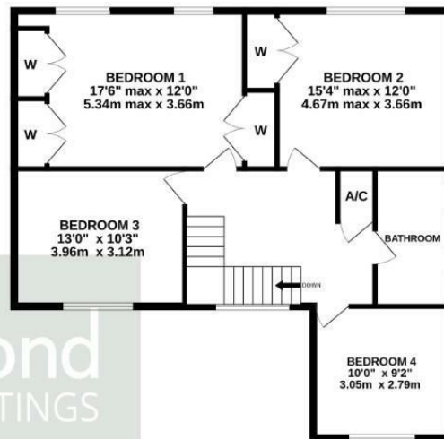
1ST FLOOR 849 sq.ft. (78.9 sq.m.) approx.